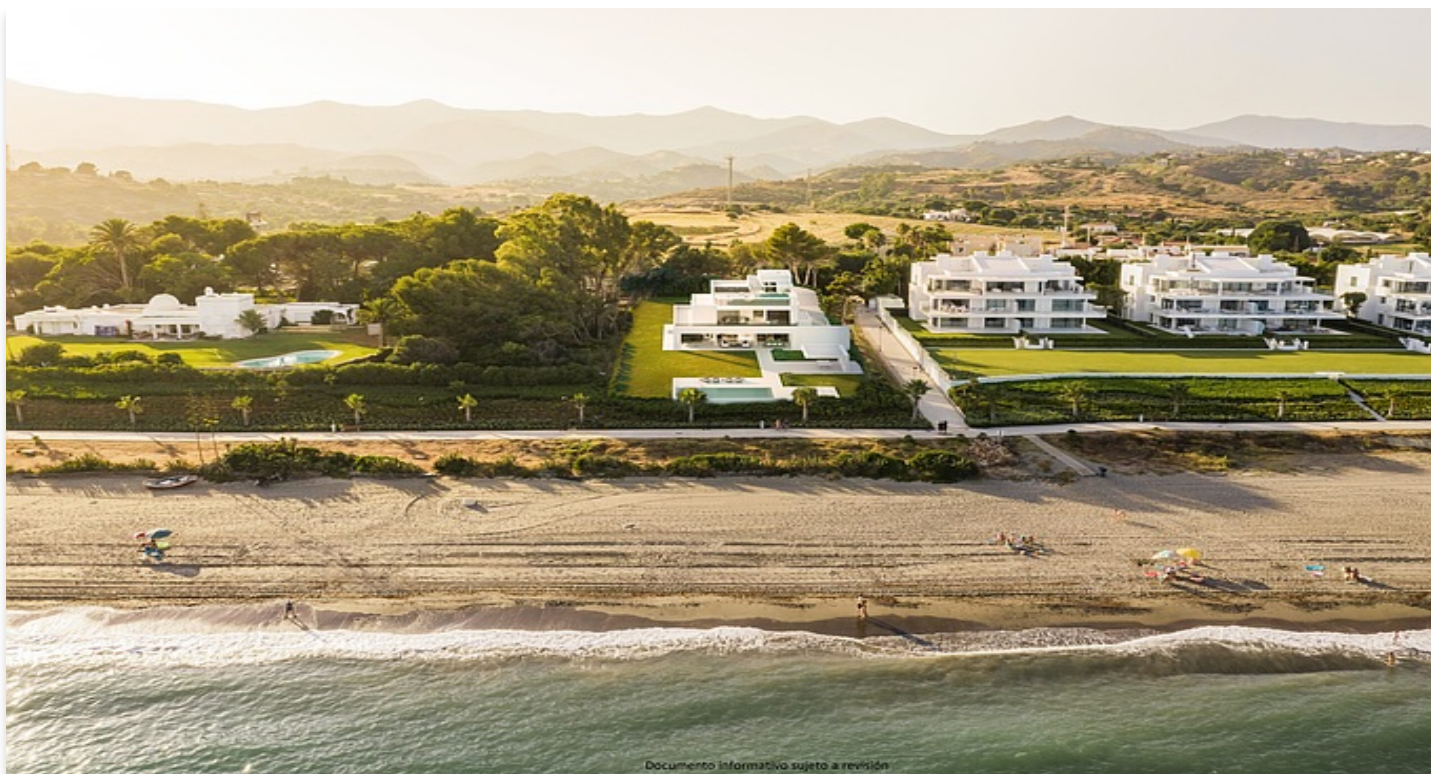
Documento informativo sujeto a revisión